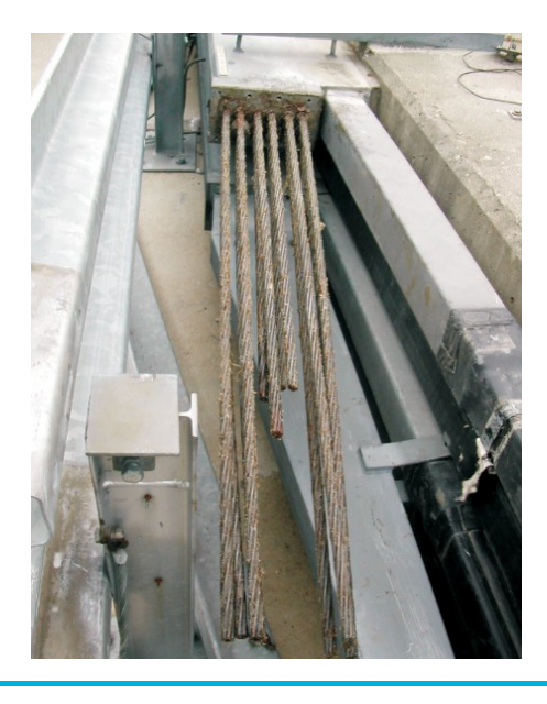
Gleitbau Ges.m.b.H. Itzlinger Hauptstraße 105, 5020 Salzburg, Austria